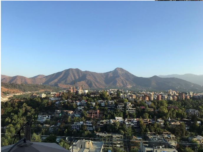
The hills surrounding the city